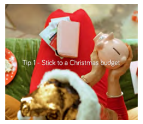
Tip 1: Stick to a Christmas budget if you can. It's very easy to get into debt at Christmas, so work out a budget and try to stick to it. For advice on how to save for Christmas, this is a really good money planner from Money Advice Service. https://www. moneyadviceservice.org.uk/en/ tools/christmas-money-planner

Not everyone is excited about Christmas this year, worried about money, heating, paying bills etc. But we thought we'd share some top tips that some of our tenants have mentioned to us, that might help you feel a little bit more in the festive season spirit.