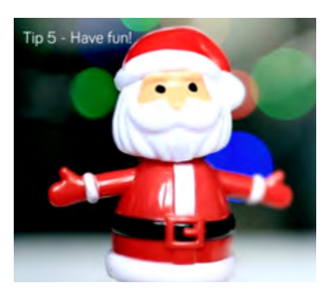
Tip 5: Spend time with people if you can, smile, laugh and something funny on the telly...but most of all...try and have a little fun!