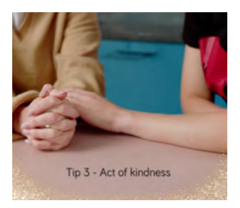
Tip 3: Before you buy presents for family and friends, maybe ask them what they need, or suggest what you'd find helpful this year? A gift doesn't have to be material, it can be a simple act of kindness that means so much more. For example: