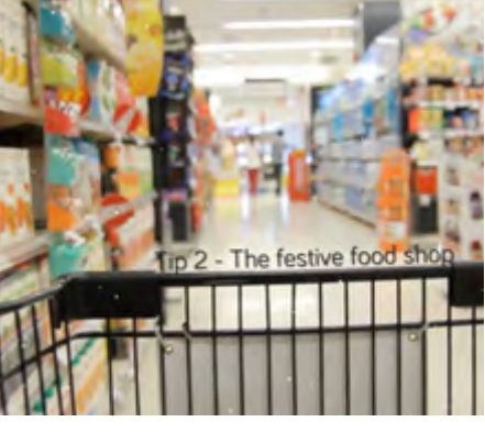
Tip 2: The festive food shop! Why not add one or two Christmas food items a week to your food shop, rather than buy it all at once, spreading the cost? For more advice visit https://www. moneyadviceservice.org.uk/ en/articles/saving-money-forchristmas