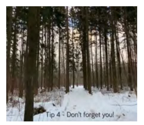
Tip 4: Don't forget you! This time of year can get a little too much and stressful. Take some time and get outdoors, have a winter walk at one of the many beautiful locations in Denbighshire and blow those cobwebs away! For ideas of walks, visit https://www. denbighshirecountryside.org.uk/ walking/

Whatever it is, we can all help each other in some way with an act of kindness.